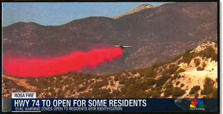
ROSA FIRE HWY 74 TO OPEN FOR SOME RESIDENTS EVAC. WARNING ZONES OPEN TO RESIDENTS WITH IDENTIFICATION