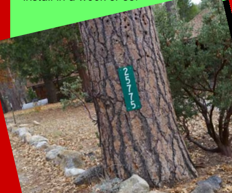
See how easy it is to find this house!

Just stop in the station during business hours and order one. They're usually ready for you to install in a week or so.